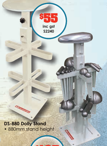
DS-880 Dolly Stand • 880mm stand height