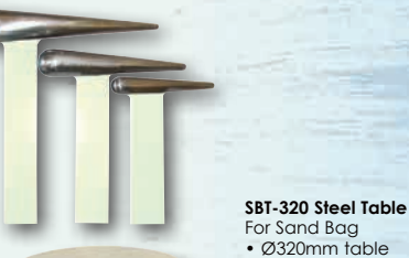
SBT-320 Steel Table For Sand Bag • Ø320mm table